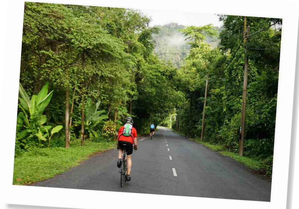
Cyclists in Perlis, Malaysia, as part of a trip by Hong Kong-based Mad Dogs.

than tripled in the past three years. Not only is cycling social -